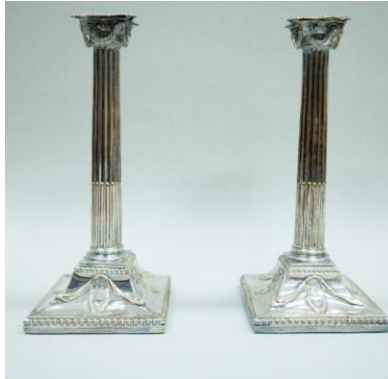
Neoclassical Sheffield plate silver candlesticks, England, ca. 1800.