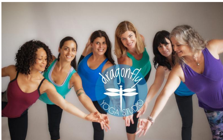
Dragonfly Yoga Studio will offer Yoga class in the Museum Garden Saturday mornings in May and June (no class Memorial Day weekend).

After stretching your mind Friday evening, you'll want to stretch your muscles Saturday morning. In keeping with the spirit of First Lady Michelle Obama's Let's Move initiative, the Museum is pleased to host Yoga in the Garden from 8:30-9:30 AM every Saturday (except Memorial Day weekend). $12 per person/$10 Friends of JMM. Walk-ins welcome!