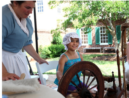
A camper having fun at "Major Monroe's History Camp" last year.

Enlist now in this two-day hands-on history camp for boys and girls ages 7-12, now in its third year! The camp features games, crafts, demonstrations, and tours that introduce children to life during the late 18th and early 19th centuries, including the American Revolutionary War and the War of 1812. Light refreshments will be served (no lunch).