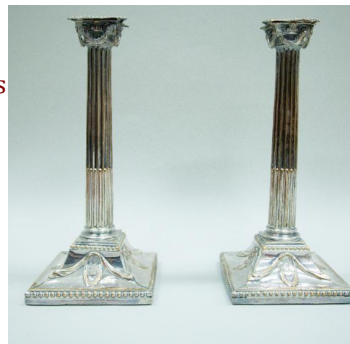
Neoclassical Sheffield plate silver candlesticks, England, ca. 1800.