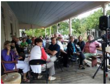
Gathered to learn about James Monroe's fight against piracy.