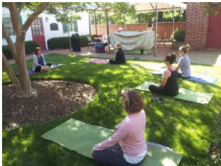
Yoga in the Garden at JMM

The Fall series of Yoga-in-the-Garden will start on Saturday, September 6 at 9 a.m.! Teachers from Healing Arts & Yoga Center will lead classes for all ages and skill levels Saturdays through October. Join us to get energized for your weekend and connect with nature! We recommend bringing a yoga mat.