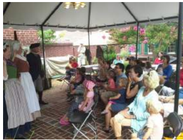
Watching "Blackbeard the Pirate"