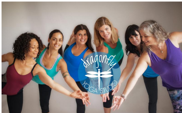
Dragonfly Yoga Studio will offer Yoga class in the Museum Garden Saturday mornings in May and June (no class Memorial Day weekend).

After stretching your mind Friday evening, you'll want to stretch your muscles Saturday morning. In keeping with the spirit of First Lady Michelle Obama's Let's Move initiative, the Museum is pleased to host Yoga in the Garden from 8:30-9:30 AM every Saturday (except Memorial Day weekend). $12 per person/$10 Friends of JMM. Walk-ins welcome!