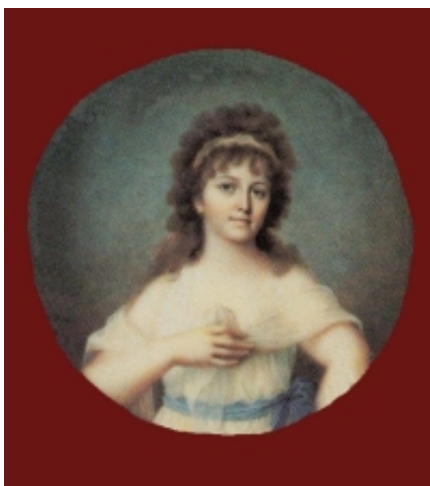
Elizabeth Monroe, by Louis Sene, 1796