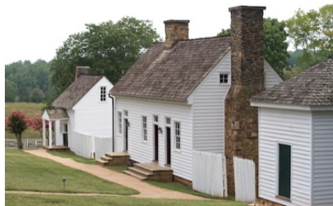
Slave quarters at James Monroe's Ash Lawn-Highland

We are proud to present our third annual lecture in honor of Black History Month on Thursday, February 12 , at 7 p.m., in the Historic Dining Room at Seacobeck Hall (UMW campus).