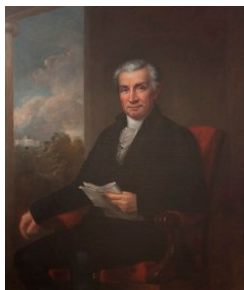
Monroe painted by Rembrandt Peale, c. 1824.

After two years, we are pleased to welcome home our Rembrandt Peale portrait of Monroe, which has been on loan to the Virginia Governor's Mansion for the building's bicentennial.