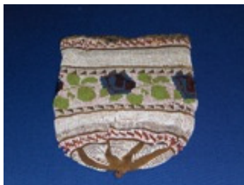
Elizabeth Monroe's beaded reticule, or purse.

We have rotated the items on display in our Costume Exhibit. Visit to see James Monroe's vest made c. 1785 (possibly for his wedding), his bicorne hat, and a waistcoat-and-breeches outfit he wore as a young lawyer in Fredericksburg. We will also display a pair of Elizabeth Monroe's shoes and a handmade beaded purse (left) that was presented to her in 1822 by members of the Pawnee Nation.