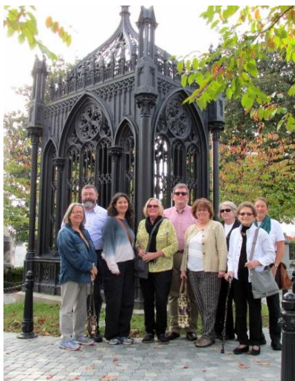
JMM staff in front of Monroe's tomb in Hollywood Cemetery.

Ten Museum staff members spent Wednesday, October 29 visiting sites in Richmond, Virginia that have ties to James Monroe. The day started at Hollywood Cemetery, at the President's Circle. Monroe's remains were brought here in 1858 from New York, where they had lain since his death in 1831. The tomb also contains the graves of Elizabeth Kortright Monroe and Maria Hester Monroe Gouverneur. Hollywood Cemetery is famous for containing numerous other figures from Virginia history, including former US president John Tyler, Confederate president Jefferson Davis, author Ellen Glasgow, and many others.