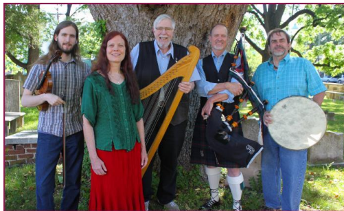
Local band Moch Pryderi will perform at the 2015 Welsh Festival

Also on Saturday, September 19, the Welsh Society of Fredericksburg will sponsor the 26th annual Fredericksburg Welsh Festival in the 900 block of Charles Street (in front of the Museum), from 11 a.m. to 5 p.m. Craft and food vendors; live music; and presentations on