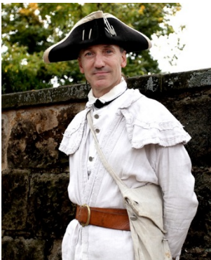
Col. James Monroe