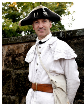
Col. James Monroe