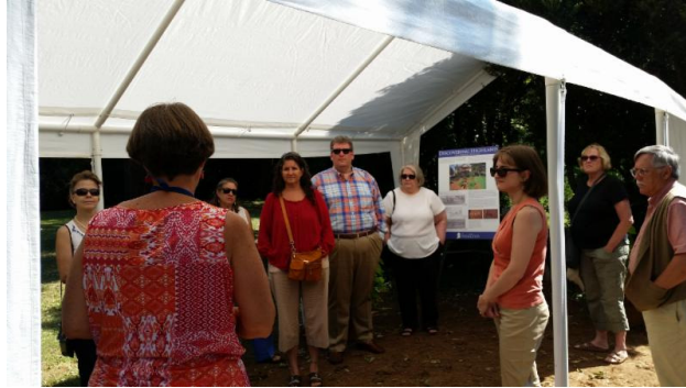
The newly discovered site of the Highland home

Staff members of the James Monroe Museum and the Papers of James Monroe were treated to warm hospitality by colleagues at James Monroe's Highland during a field trip on August 30. The JMM staff visit reciprocates similar visits by Highland staff to Fredericksburg in recent months.