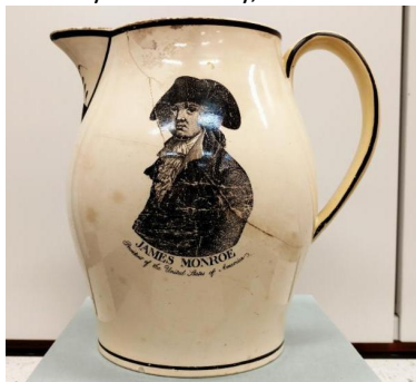
English transfer-printed creamware jug depicting President James Monroe, ca. 1820