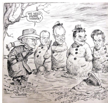
Political cartoon featuring potential Republican candidates for the 1952 presidential election