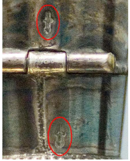
The Dutch sword mark on three different sections of the silver lid, verifying the quality of each section.

"Crystal" glass, as opposed to common glass, has a higher lead oxide content, giving it an improved appearance and rendering it more malleable during the working process. During the 19th century, as well as today, these properties were well-suited for smaller objects like perfume bottles. In the